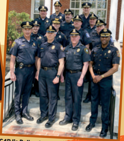
C4RJ's Police Council now represents 20 cities and towns.

"This model has a strong track record of success in our neighboring communities, and I'm confident that bringing it to Winchester will provide residents with meaningful and lasting resolutions when they are impacted by certain types of crime."